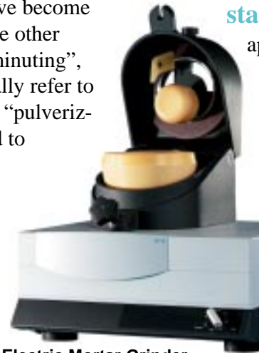
Electric Mortar Grinder Fine grinding

staff@glenmills.com to discuss your application