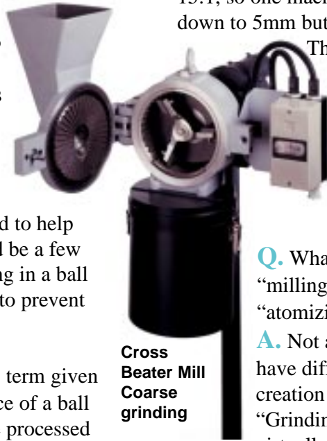
Cross Beater Mill Coarse grinding

A. For a product that will be used wet it makes sense to grind it wet rather than dry it, grind it and wet it again. Wet grinding helps to reduce dust and contamination hazards. Also if very small particles are required (single digit micron and less) wet grinding is one of only a few methods to give consistent results (another option is jet milling).