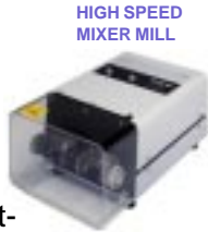
HIGH SPEED MIXER MILL

These mills use a violent shaking action, either side-to-side (wrist-like) or up-and-down to produce rapid cell disruption in single 2ml vials, multiple small vials, 96-well titer plates or jars as big as 50ml.