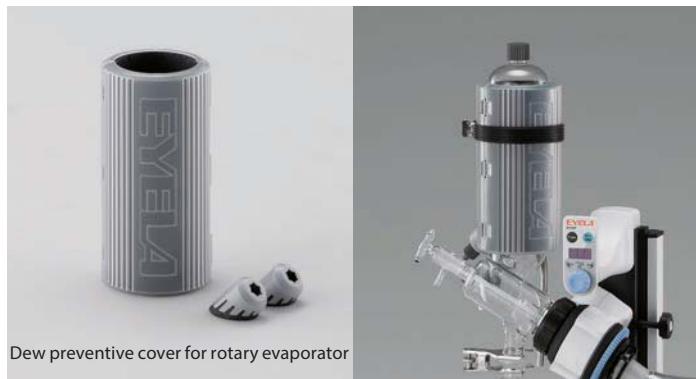
Dew preventive cover for rotary evaporator